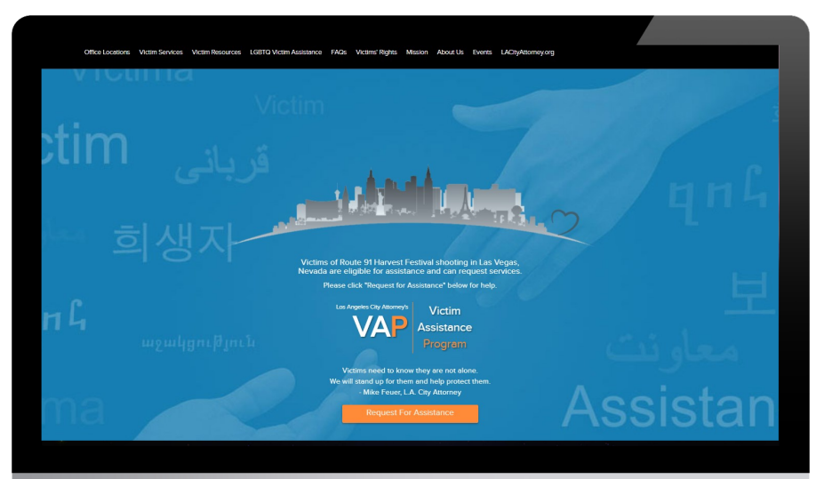
Case Management System

Visit <u>helplacrimevictims.org</u> or download our app to get resources, find office locations, and request assistance from Los Angeles City Victim Advocates.